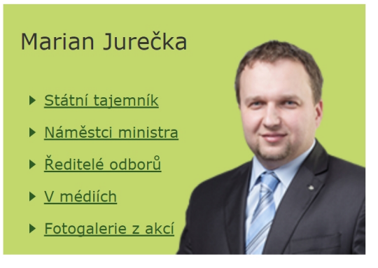
Figure 2: Screenshot of the website – part with the image of minister.